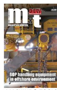
MACHINE & TOOLS