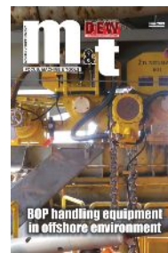
MACHINE & TOOLS