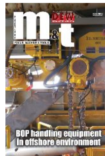
HUMAN RESOURCES MARINE & SHIPPING MACHINE & TOOLS